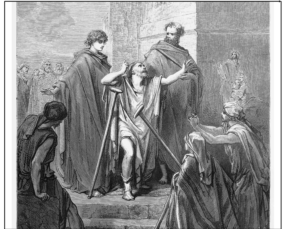
Peter and John curing the lame man It is faith in Him that has restored this man to health Act 3:16